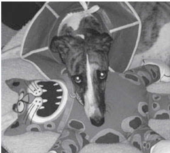
Lucky got lucky and was adopted.