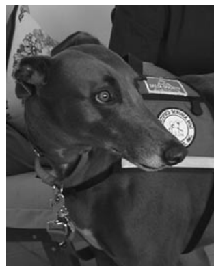
Blueberry Hound, certified service dog